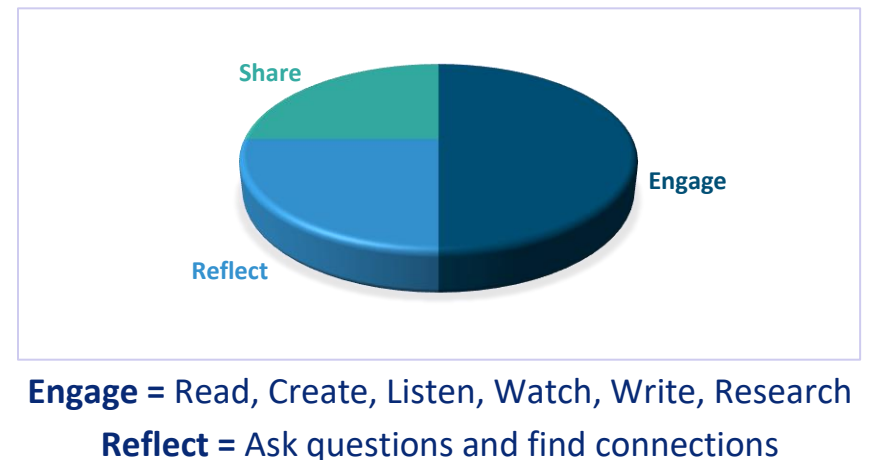
Share = Share your thoughts and discuss your ideas

By just adding in a hour a week of super curricular activities, you could be enhancing your grades and opening up more opportunities for your future simply by broadening your understanding of a particular subject areas. The following gives you an example of how you might wish to break down that hour.